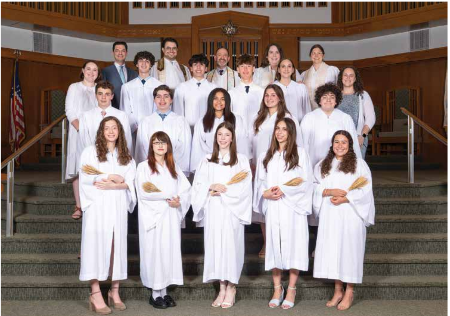
Mazel tov to our 10th grade students on their Confirmation!